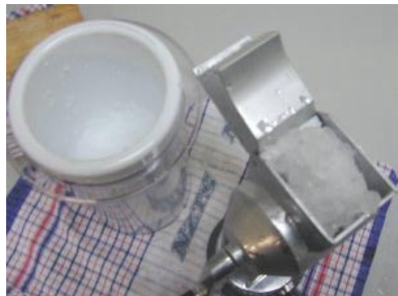
Ice cubes in the grater prior to being shaved to smaller pieces and placed in to the ice bucket.

Important note. Keep the maximum size of the shaved ice pieces to 1mm long.