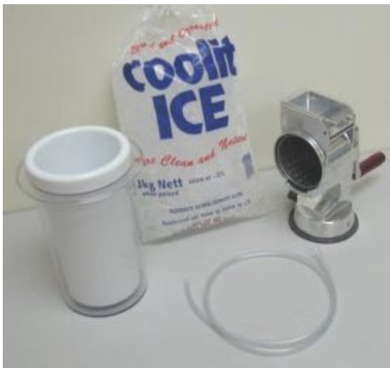
Basic equipment needed for ice point check.

A medium sized plastic bucket approximately 255mm or 10" high that will hold the ice mixture during the test.