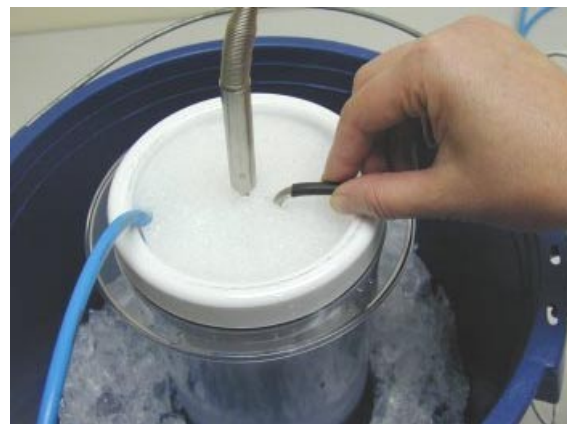
Reference probe and Temprecord logger probe inserted into ice point.

Doing this will give you an idea how accurate your logger is when compared to the calibrated reference PRT.